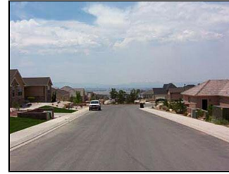
Some of Ashdown Forest is already built