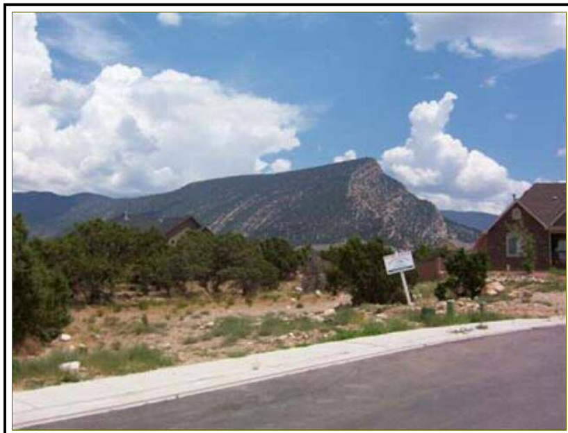
Beautiful building lot in Ashdown Forest