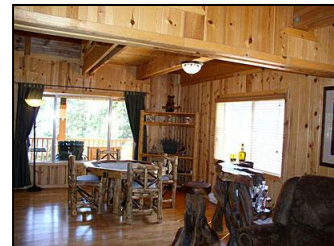
Game Table Area