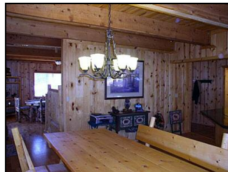
Dining Area off Kitchen