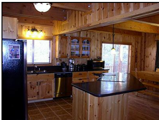
Kitchen w/ eating Bar