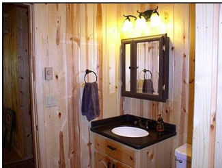
Main Floor Bath