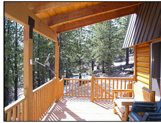
Very Useable Covered Decks