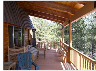
Deck with Gorgeous Views