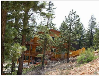
Spring has Arrived!