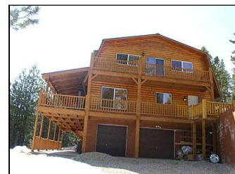
Exterior side of cabin