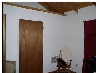
Bedroom 1 view 2