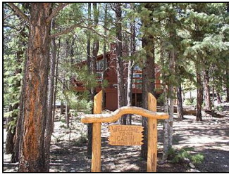
Cabin in the Woods