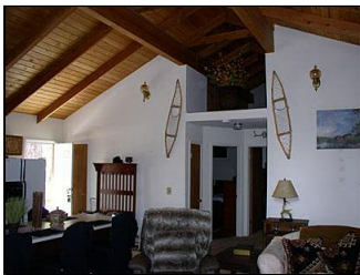
Great Room View 2