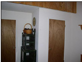
Bedroom 2 view 2