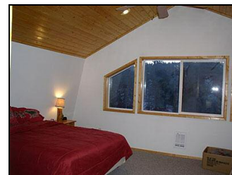
Upper Bedroom 1