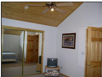
Upper Bedroom 2