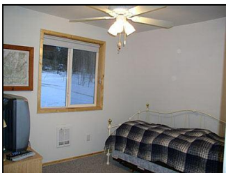
Main Floor Bedroom