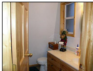
Main Floor Bath