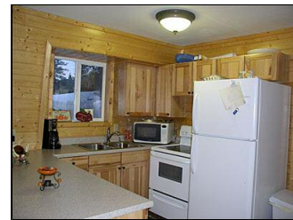
Appliances go too!