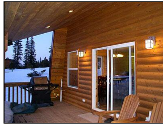
Deck with views off Front