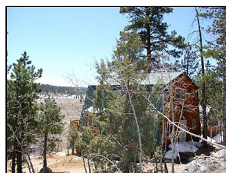
Cabin from a distance