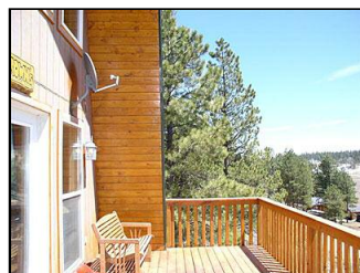
View from Deck