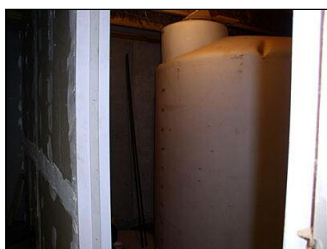
Water Storage Area in Basement