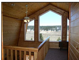
Great Loft Windows