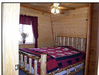
Main Floor Bedroom