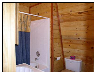
Main floor Bath